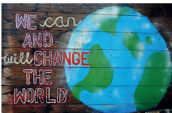
Art at Reepham Allotment, the first of many school gardens