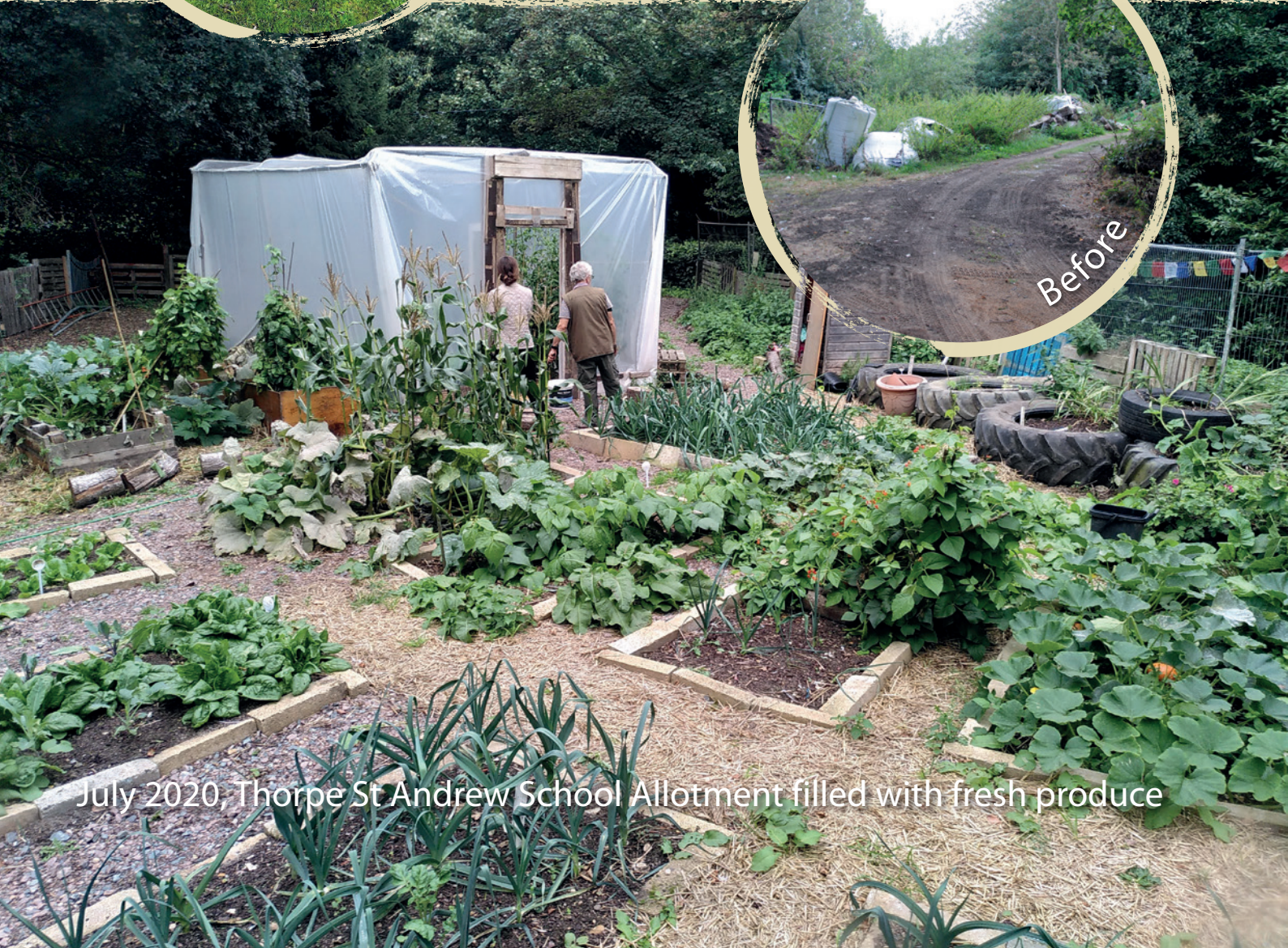
July 2020, Thorpe St Andrew School Allotment filled with fresh produce